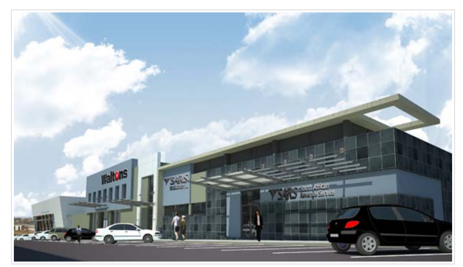
The SARS building is in the process of being substantially refurbished and is currently being fitted out as A grade offices with completion hopefully scheduled for the end of January 2011. SARS

The good news is that developer Dave Keal has exciting plans -which include an extensive R17 million restoration and redevelopment which will begin in January next year. "The idea is to put Port Shepstone on the map again as the thriving town it once was," said Mr. Keal. This grand undertaking will include a complete renewal of not only the Bedford Centre, but also the Post Office and the block of buildings in Bisset Street stretching from Waltons up to the new SARS building (previously GG Glass, who have relocated across the road).